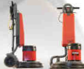
Europa V Range

Please visit our web site www.victorfloorcare.com for details on the full range of industrial floor cleaning equipment or call our sales office on Tel:0121 706 5771.