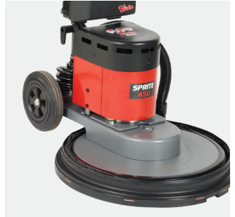
Fitted Skirt Ensures suction levels remain high creating a dust free, perfect finish.