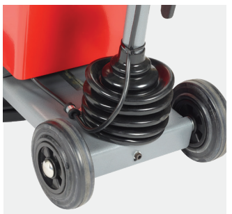
Easy to Transport Sturdy wheels enable effortless transportation.